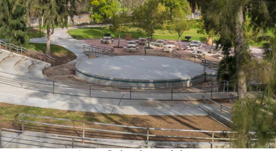
Arovista Park outdoor amphitheater

According to the Arovista Park page on the City of Brea's website, as part of their new modernization project, the City is planning to add "the first allaccessible playground in North Orange County, which will provide an opportunity for children and adults of all ages and all abilities to have a safe space to play and enjoy the outdoors." Looking at the "modernization concept" map on the website, it appears that the renovated playground will include new swings along with a hill slide zone and an inclusive play structure with upper and lower access. The planned playground will be larger than the current one and located next to a newly planted tree circle. It also looks like more natural, and structural shade will be added to the area, according to the park concept map. "The recent approval for another major renovation at Arovista...will be extraordinary including an all-abilities playground," said Linda Shay. Jenn Colacion, Senior Management Analyst in the City of Brea's Community Services Department, explained that the renovation project really started with the community's interest in a unique and all-accessible playground. "Our interest in working with landscape architect David Volz Design was to include multi-sensory features and play equipment that will