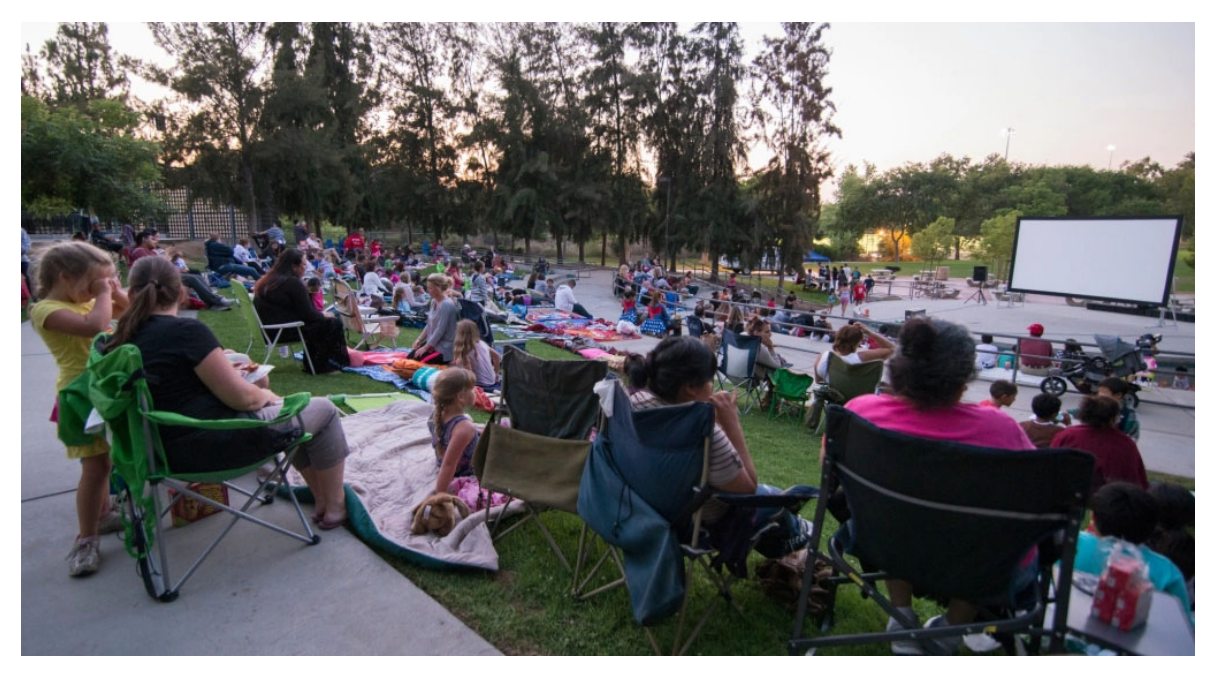
Familes prepare to watch a free movie ie at Arovista Park in Brea.