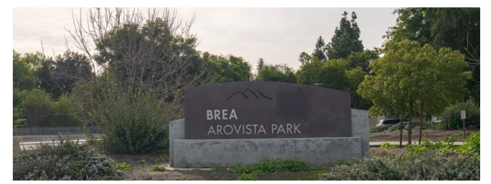
Brea Arovista Park sign from Imperial Highway

Video Observer by Emerson Little © 2023 Visit Emerson's YouTube Channel For More